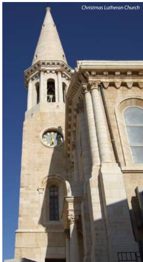
Christmas Lutheran Church

Tour the Old City, starting at the Western Wall, considered to be one of the holiest sites in the